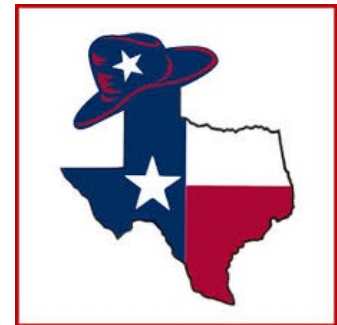
Red Texas Forum - Dallas