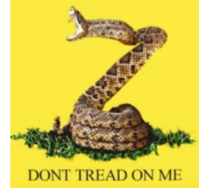
Cass County Patriots